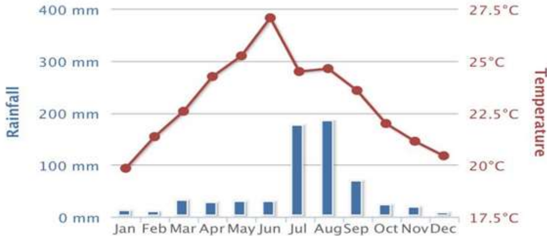
Figure 2. Average monthly temperature and rainfall at Woreda from 1990 to 2012.

land (34.1%), grazing land (17.9%), forest (27.1%), and water bodies (6%), rocky land (5%) and others (9.9%), respectively (Dereje and Desale, 2016).